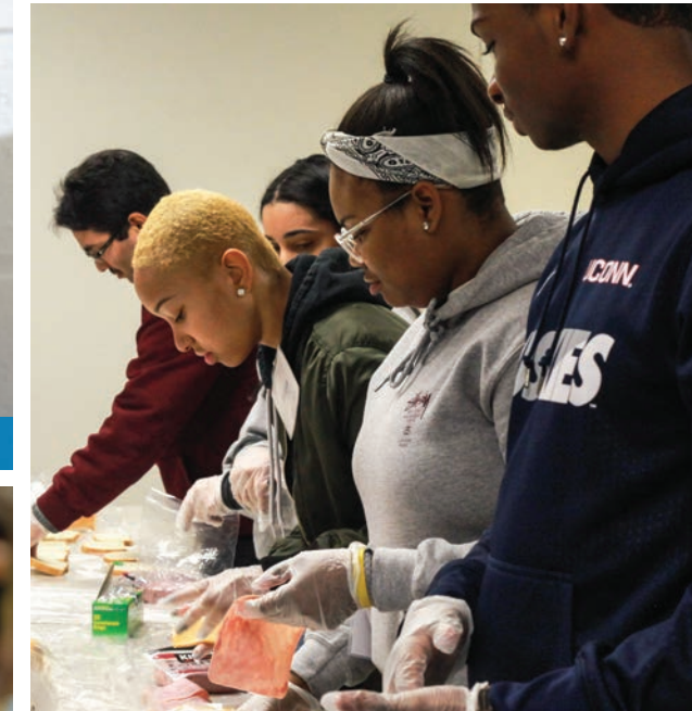
Neighbors Fed & Sheltered