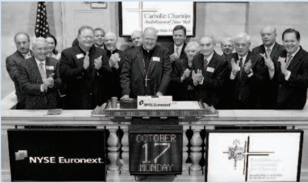
The Wall Street community celebrated the annual Cardinal's Committee for Charity Wall Street Breakfast on October 17, 2011. His Eminence, Timothy Michael Cardinal Dolan, along with Board Members and Catholic Charities supporters, rang the Opening Bell.