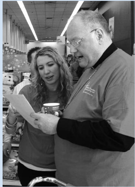
Photos include a sampling of His Eminence, Timothy Michael Cardinal Dolan's support throughout the year. Clockwise: Mass for the Disabled, St. Nicholas Shopping Day, Part of the Solution (POTS) food pantry, St. Francis of Assisi food line, Morning Prayer Service for the Elevation of Cardinal Dolan, Cardinal McCloskey Head Start.