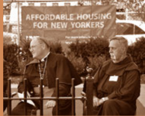
Archbishop Timothy M. Dolan fields calls on Catholic Charities Immigration Hotline and blesses Lott Community Development's All Saint's Housing affordable housing in Harlem (Left and right). A mother (center) helps her son at Catholic Charities Thanksgiving turkey-and-all-the-trimmings distribution in Harlem.