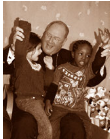
Archbishop Timothy M. Dolan enjoys Christmas with children at the Lawrence Hickey Center of Childhood Development, part of Astor Services for Children & Families, in the Bronx.