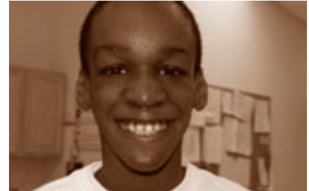
Children served by Cardinal Hayes Home for Children in Millbrook, NY that treats young people with developmental disabilities (L and R) and children served by Incarnation Children's Center, Inc. a pediatric nursing facility specializing in the care of children with HIV/AIDS (center).